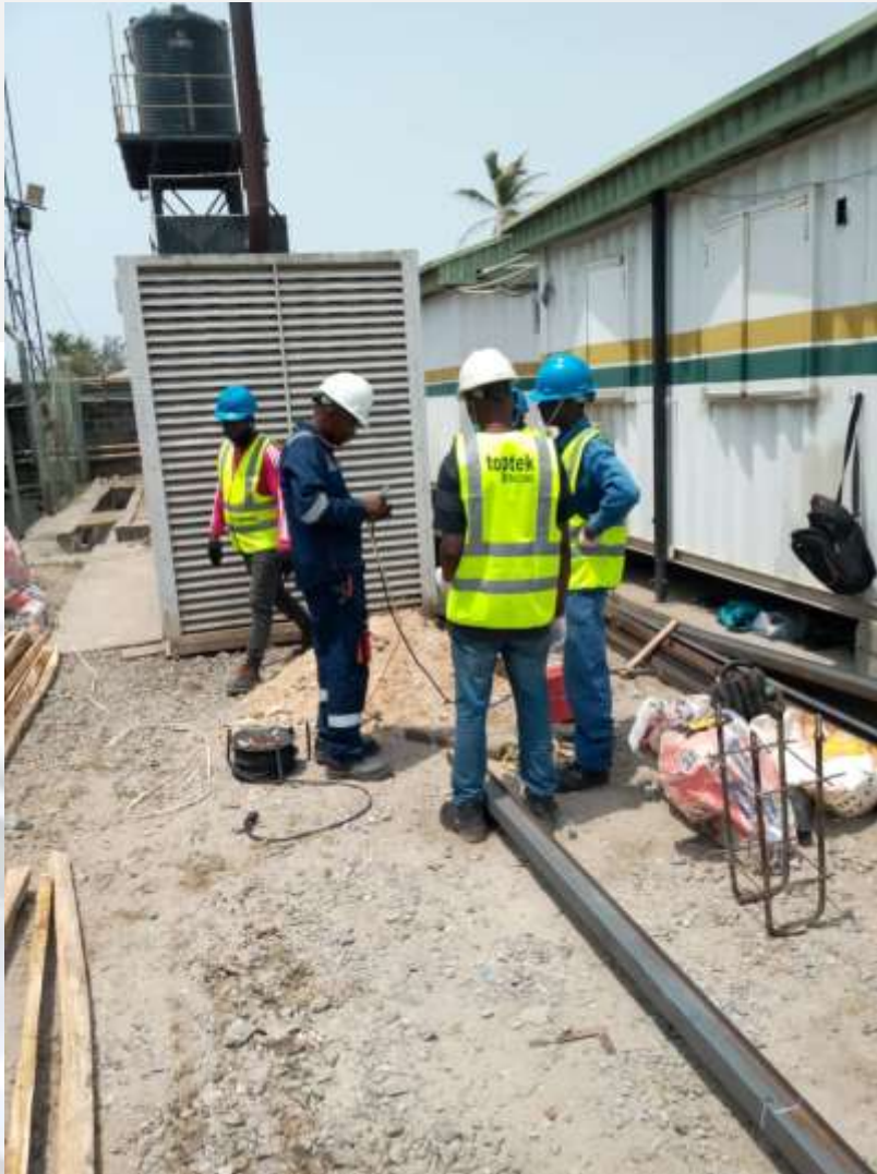
Remodeling of a 5 bedroom duplex with basement at Magodo GRA II