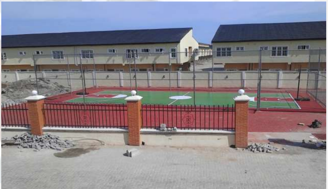
CONSTRUCTION OF RECREATIONAL FACILITIES (BASKET BALL AND LAWN TENNIS COURTS) FOR LEKKI GARDENS, AJAH, LAGOS