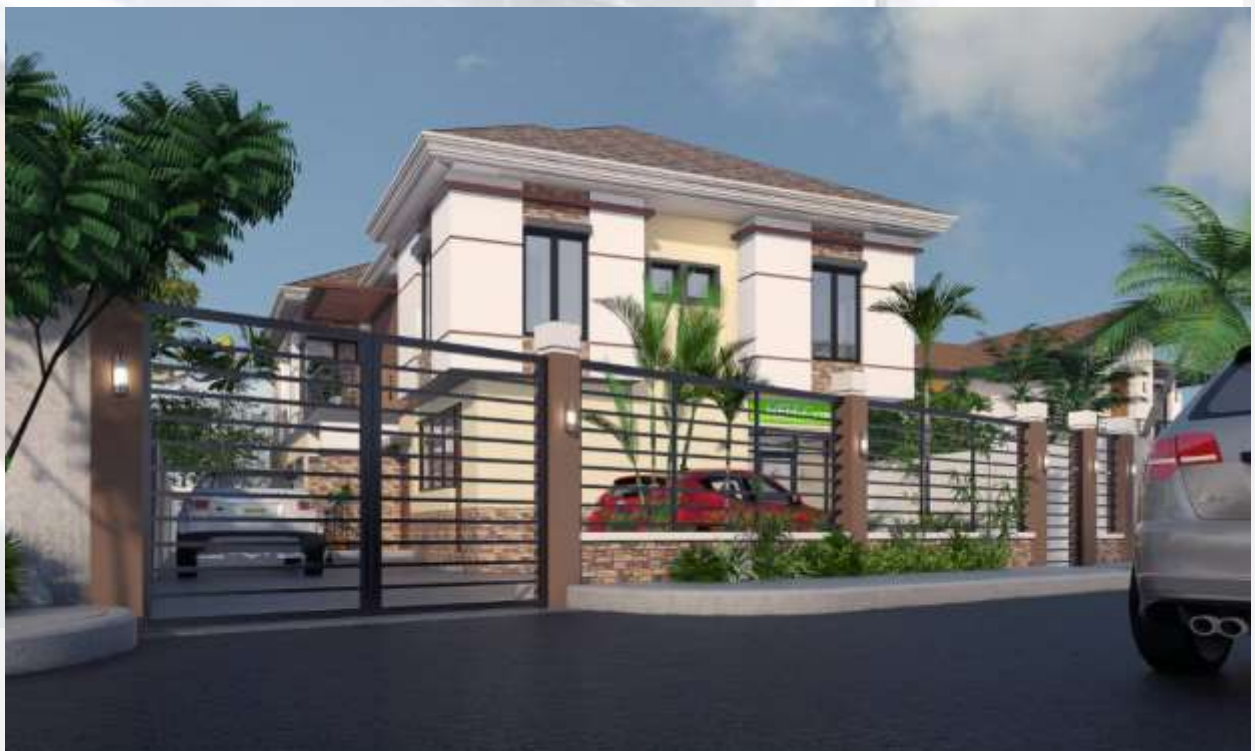
DESIGN OF BLOCK OF FLATS AND OFFICE APPARTMENTS IN EGBEDA, IBADAN, OYO STATE.