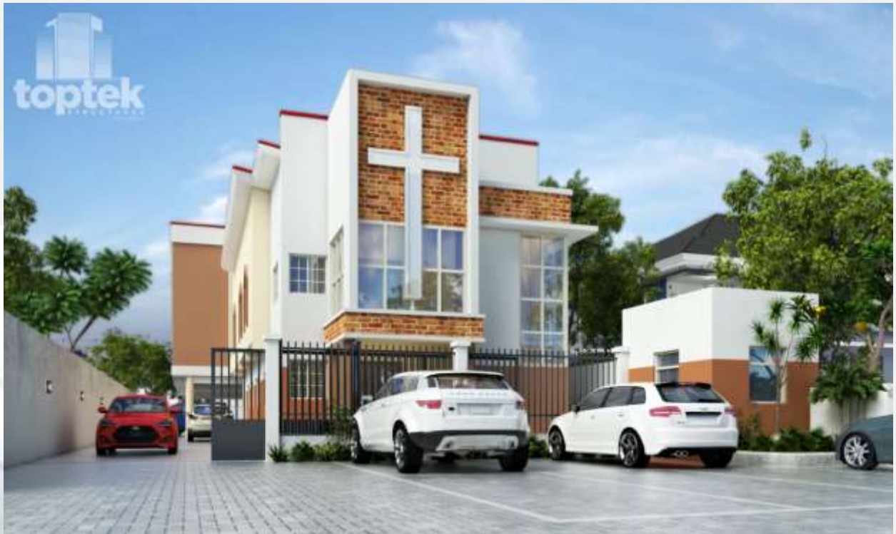
DESIGN OF 1500 SEATER CHURCH AUDITORIUM FOR NRBC, AREPO, OGUN STATE