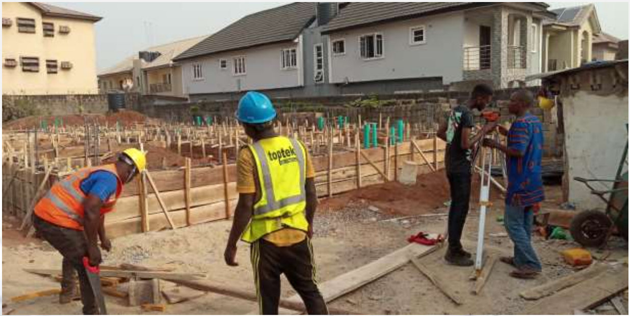
Construction of 4 units of 4 bedroom duplexes at Abudu Odusanya, Magodo