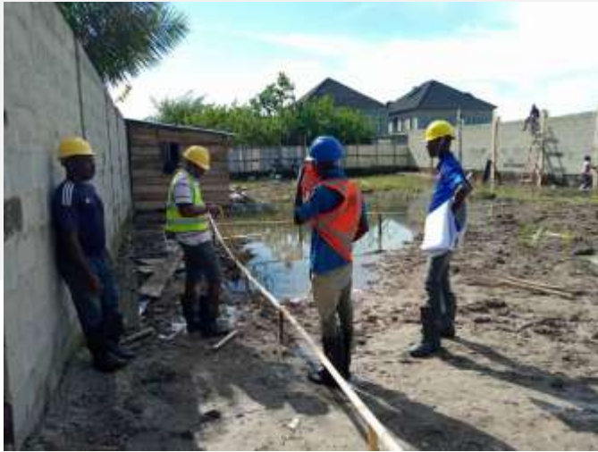
Construction of 2 Nr Residential Apartments At Abraham Adesanya Estate, Ajah, Lagos.