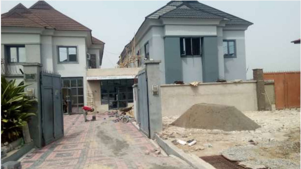
Construction/Remodeling of Headquarter Office Buildings (With basement) For Natnudo Ltd at Basheer Shittu, Magodo Phase 2 GRA, Lagos.