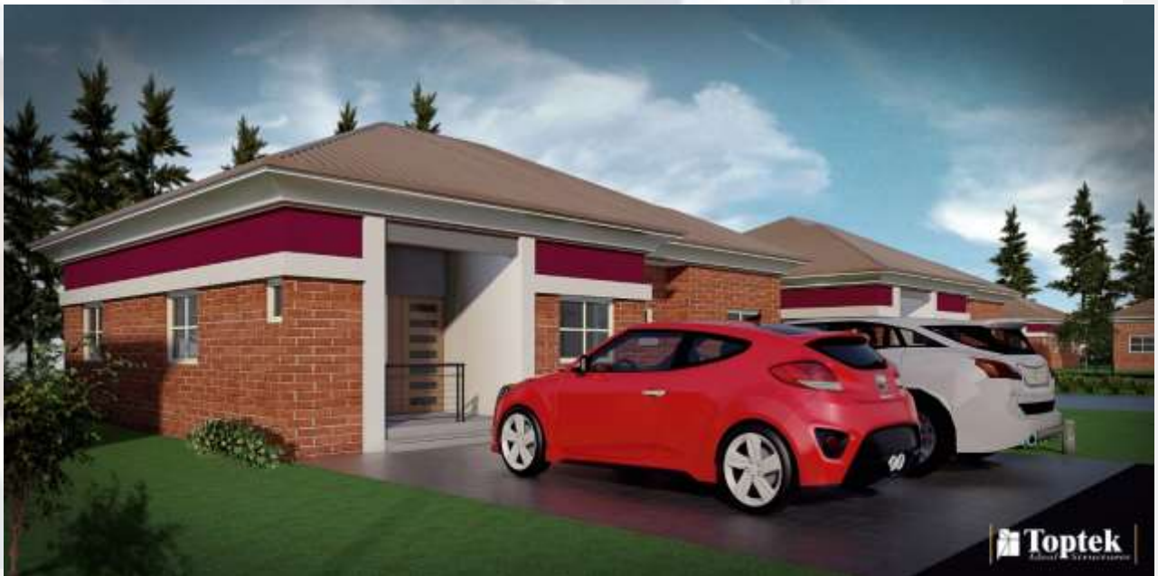
ARCHITECTURAL DESIGN OF 10 POWER LOW COST HOUSING ESTATES FOR TOUCH ENERGY OIL AND GAS LTD.