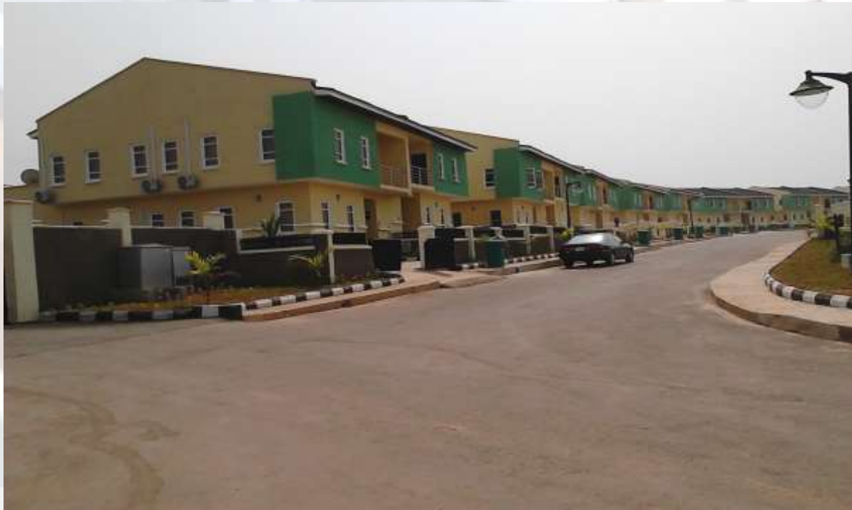
CONSTRUCTION OF SEMI DETACHED DUPLEXES FOR OGUN STATE GOVERNMENT, ORANGE VALLEY ESTATE, OBASANJO HILTOP, OGUN STATE.

(SUB-CONTRACTED BY INTEXT SOLUTIONS LTD)