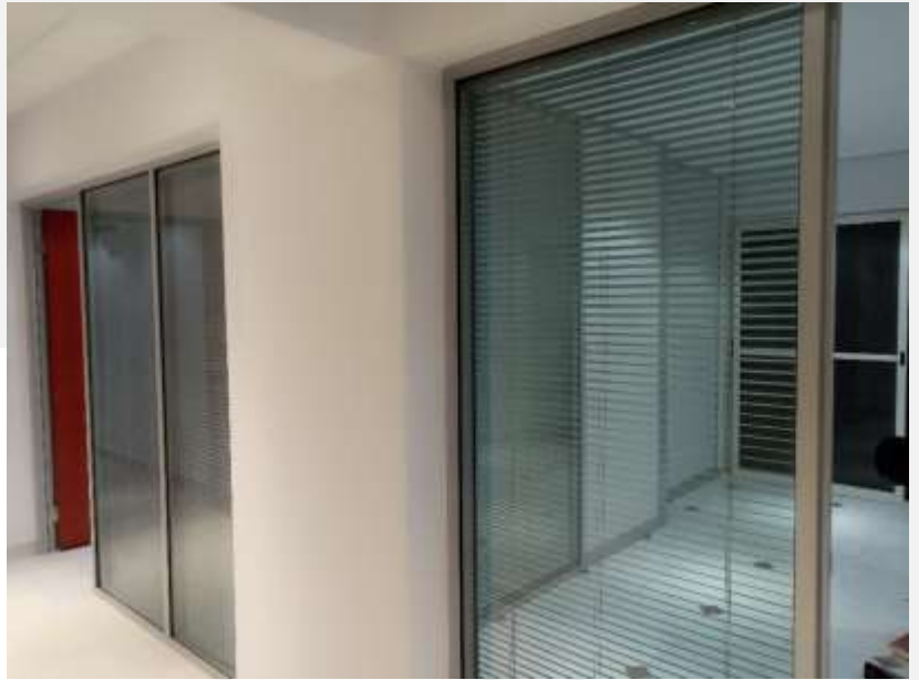
African Circle Pollution Management Ltd, Ikoyi Office Interior works (In Partnership with Bricks International Concept Ltd)